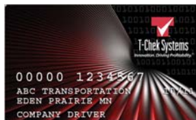
T-Card (beginning to phase out Oct. 2010)