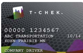
New T-Card (beginning in October 2010)