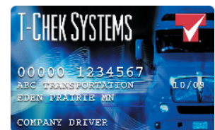
T-Card (phase out March 2009)